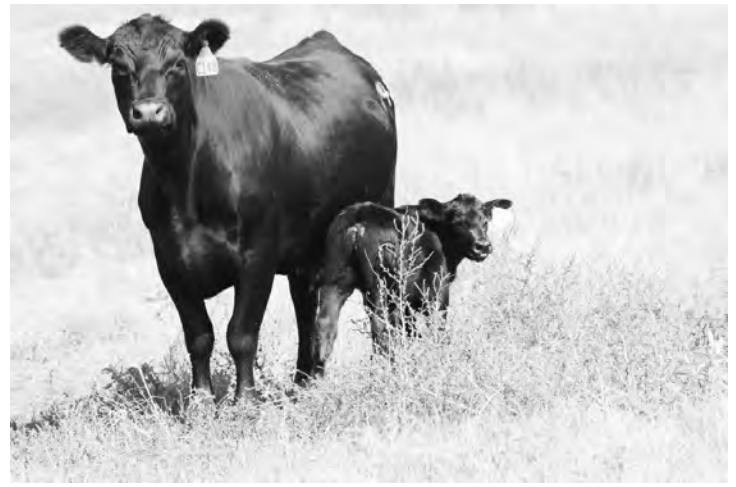
New mom – very attentive to the camera person!