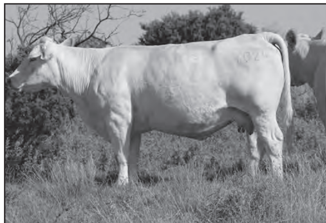
Y024, dam to Lot 5-1 has been a consistent producer.

Carcass, Fertility and Calving Ease in this heifer with a Top 5% Marbling EPD, Top 25% CW EPD, Top 25% RE EPD Top 3% Scrotal EPD and Top 4% BW EPD.