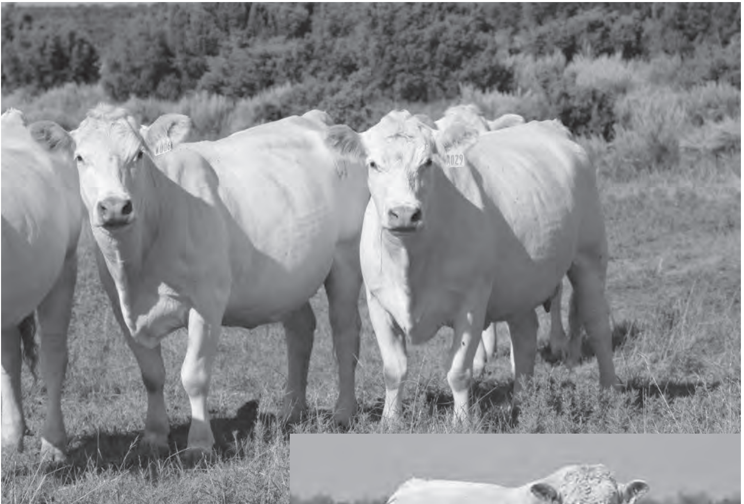
Reference Sire, M6 Cool Maker 261