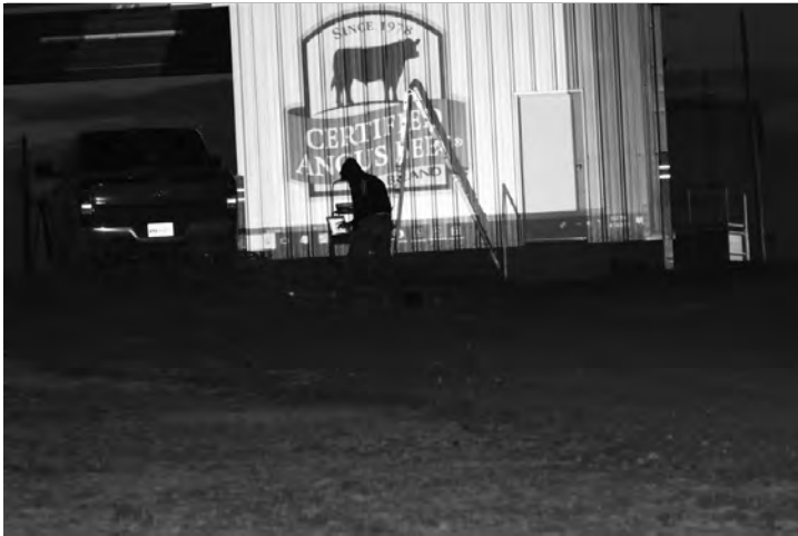
Troy the painter, starts the process at night by projecting the CAB image onto the barn.