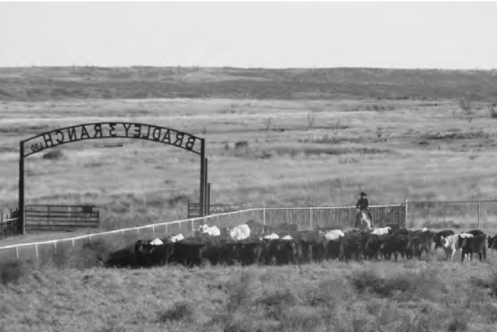
Cattle have been worked off a horse, as well as on foot and a 4-wheeler.